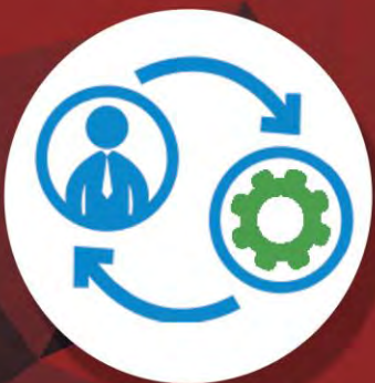
Business Process Management